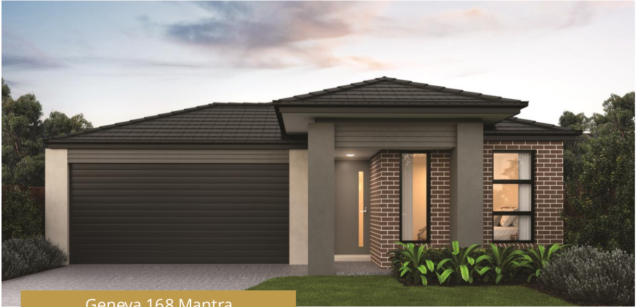
Geneva 168 Mantra